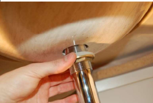
Above: Drain Attachment