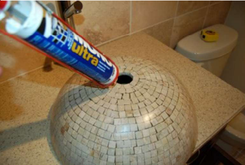
Above: Process for "Above Counter Mounting"