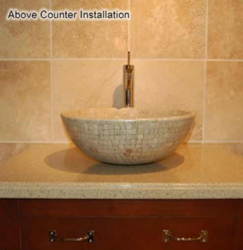
Above Counter Installation