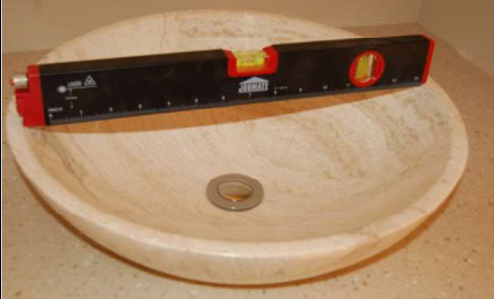
Above: Process for "Recessed Mounting"